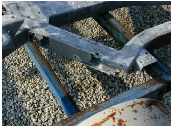
Notice the tell tale crack:

Ryan was actually up at 8:00 on a Saturday ☺