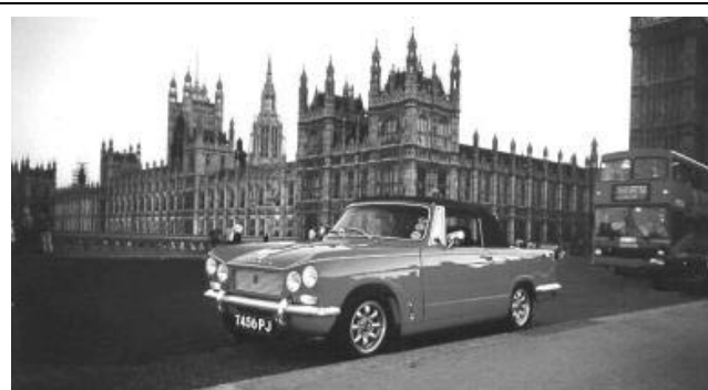
Leon's Car Somewhere In London, Can You Guess Where?

Leon: "Wwe can still show em! Wunderbar"