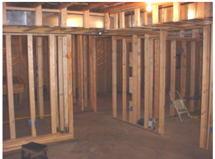
Forest of 2x4's – Music Room, etc.

We decided to completely finish our basement, doubling the room in the house. Although we're not doing most of the work ourselves, I have been doing the sound/phone/CATV wiring – about 2200 ft of wiring total, and this impacts garage wiring, so I've had to work that too. This means no work on the TRs. Oh, where did the stuff in the basement go? Into the garage, taking up one of the places for cars and making the garage a cramped mess. This means no work on TRs. How much is this costing? Don't ask, but it really means no work on TRs! Oh well, at least the house smells like fresh-cut pine!