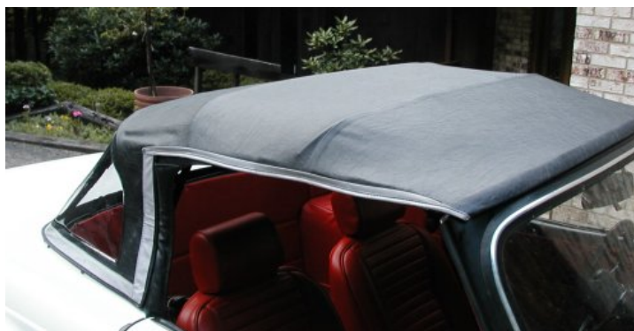
Side snap installation