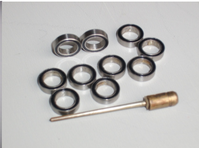
Stromberg 175CD-2 with spindle ball bearings fitted. Bearing covers omitted for illustrative purposes.