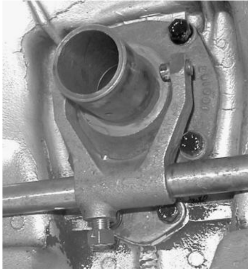
Clutch fork with pin installed

The following photos are of a transmission case that the throw-out bearing and main shaft have been removed for clarity.