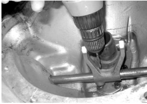
Drilling hole in clutch fork