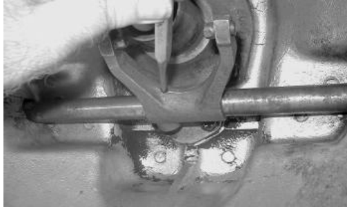
Driving out remaining piece of pin.

To minimize possible future problems removing broken pins, before I install a fork, I always drill a 3/16-inch hole in the end of the pinholes of forks that don't already have a hole.