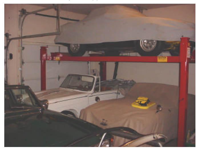
Shhhhhhhh, the wabbits are sweeping....