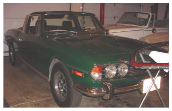
People's Evidence #1 – '73 Stag