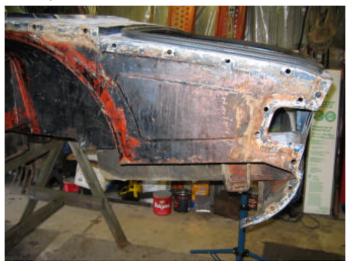
I am attaching several pictures to show you the rest of the chassis, with the engine still on the frame.

Surprisingly it was pretty much intact, which made for a much tougher job of removing the undercoating. After much trial and sweat, I found that the best way to remove this undercoating was to spray it with kerosene and let it soak for 24 hours. You then need to fire up the propane torch, make sure the area is well ventilated, heat up the undercoat for about 25-30 seconds and apply the old scraper and go to town. It comes off fairly easy using this combination. Notice the rear fenderwell, it is pretty clean and very little rust.