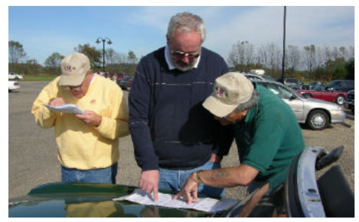
Do you think we know where we are going?

The second weekend of the month we participated in the MG clubs fall tour up to the Wooster area. The weather was nice, four of us joined in from BT. The roads were nice, about 300 miles total. Here is the best picture for the day that Bill Blake took: