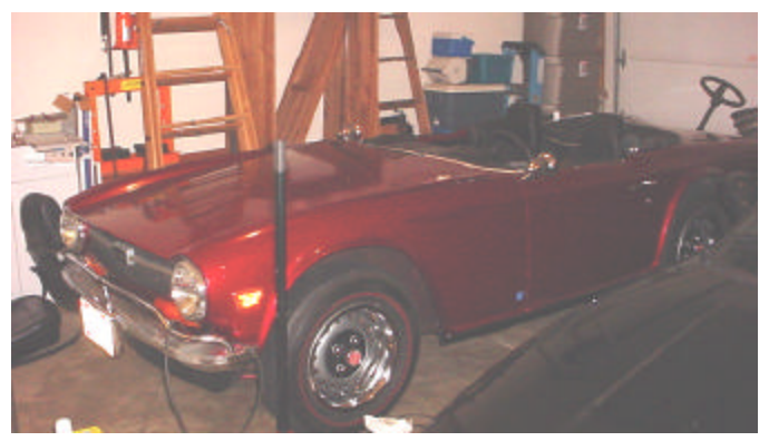
October: TR6 Awaiting a Windscreen...

them from The Roadster Factory. I also picked up other spares where I could, like a complete set of Michelin X redlines on wheels w/trim rings from John Huddy. Kinda funny – even after all these years without a TR6 in the garage (about 13) I still know what is what! The goal was to spend $500 on the repair to get it on the road. Underestimated reality – we're up to $1100 now and we still have to buy and install a top! This has been somewhat offset by ebay sales of un-needed parts, but we're still over budget.