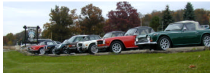
Notice who has their tops down

Winner of VTR Best Newsletter Award – 2003!