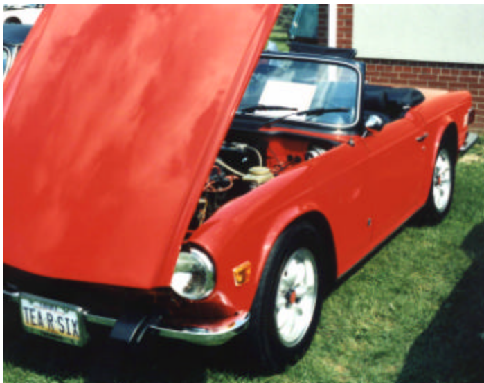
Good license plate.