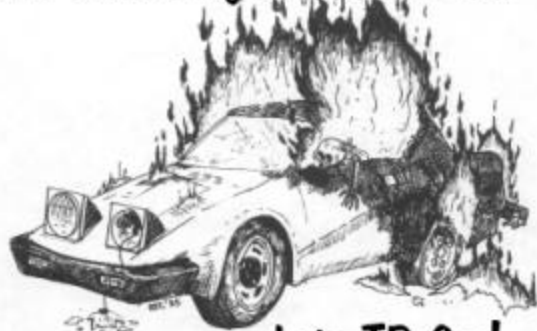
Late TR Guy!