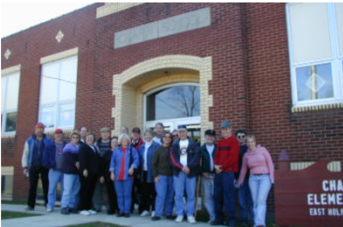
Here we are attending "Charm" School