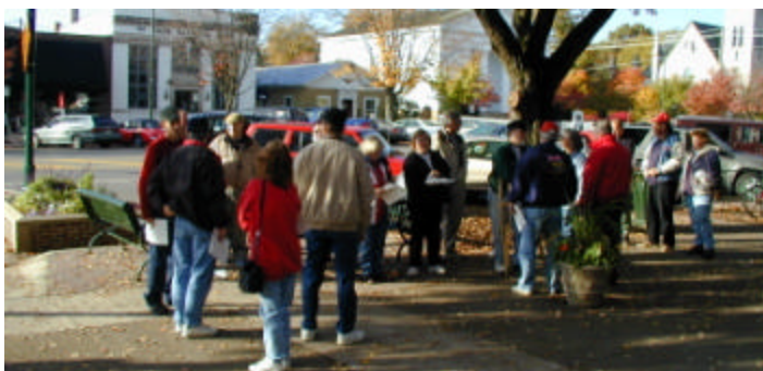
Preparing to leave Granville (Sun shining and everything)