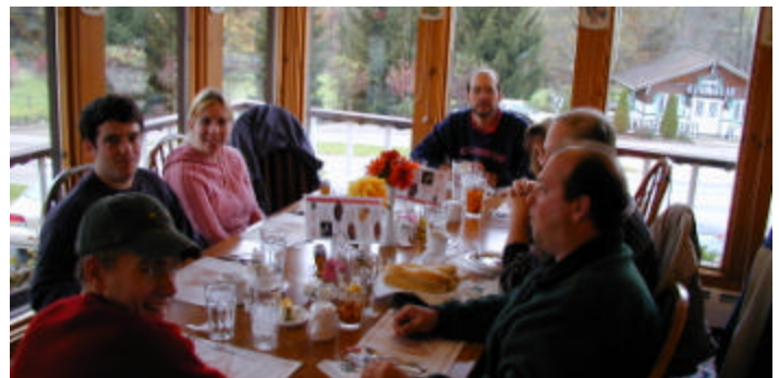
Lunch at the Chalet in the Valley