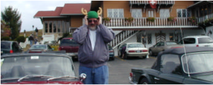
How to stay warm in a TR6 when it's 55 degrees