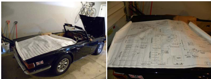
(a little humor for your newsletter)