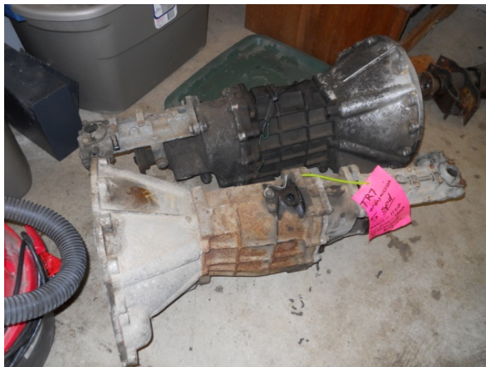
Two trannies adding to the stuff in our garage...