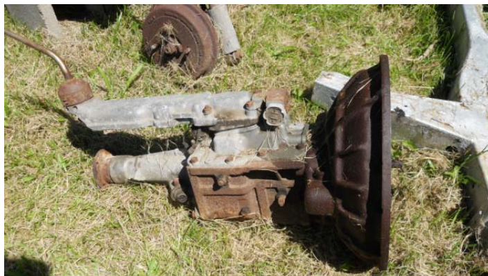
Cute little Spit tranny – forgot how small these are

Comment – Somebody got a good buy here. Most of the little parts were not there, like seats, glass, driveshaft, front suspension, etc., but the body tub only had a few small areas of rust, and the frame, although sporting a hideous paint job, seemed solid. The transmission was cute too!