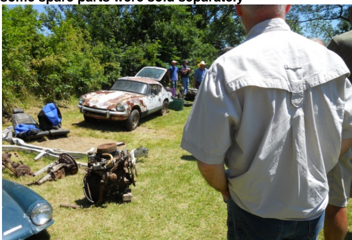
Sold for $150. The spare parts got almost as much, and I forgot how much the engine went for...

Comment – Uhhh! Body was somewhat solid, but what a project – have to dip this one due to all the different paint coats and surface rust. It did come with some new metal pieces. Yuk! About what it was worth!