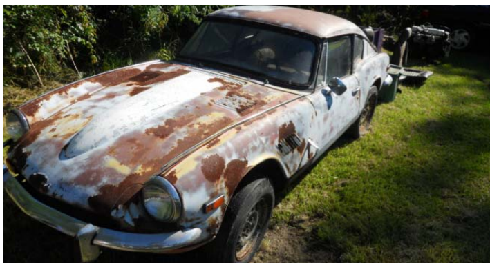
GT6 – I think 1970. Just a rolling body - an engine and some spare parts were sold separately