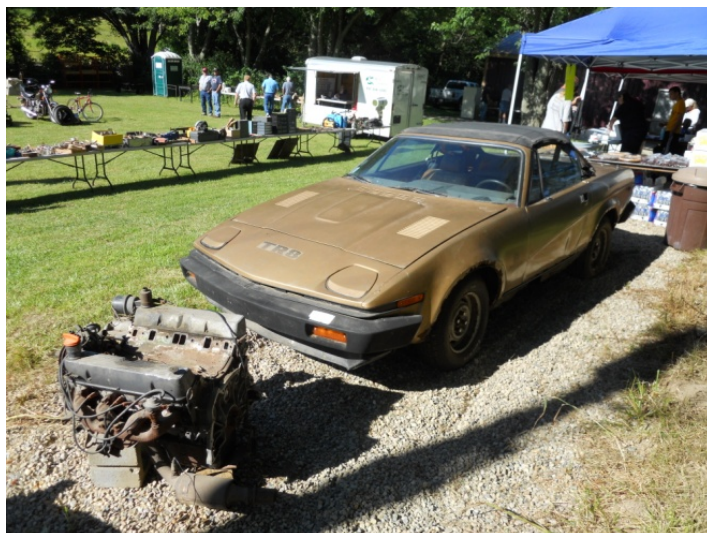
1980 TR8 with spare (Rover SD1) engine – car is a parts car, mostly complete, but rusted-out body and usual problems for a car that has been sitting in a field for a while with a bad top...I don't think there were a whole lot of usable parts on it.