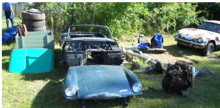
Spitfire 1500 in parts, incomplete, but with a can-chrome-paint-sprayed frame