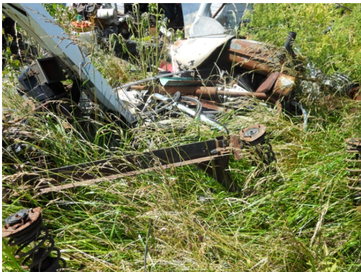
There are gobs if TR7 front suspensions under the grass waiting to be discovered...