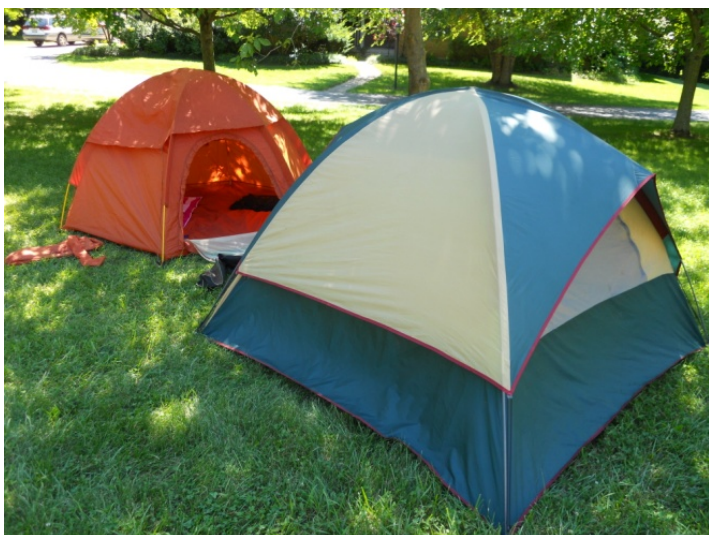
Tents in the yard. I actually stretched-out in the orange one and tried to take a nap...