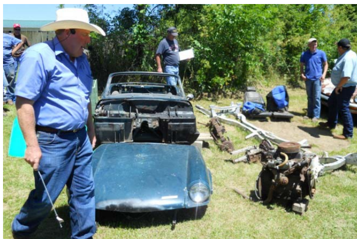
Sold for $160 – The Auctioneer has the hat on... Actually seemed like a good buy, the tub was really solid. The green Spit hardtop behind the auctioneer went for $110 in a separate sale.

Comment – Somebody got a good buy here. Most of the little parts were not there, like seats, glass, driveshaft, front suspension, etc., but the body tub only had a few small areas of rust, and the frame, although sporting a hideous paint job, seemed solid. The transmission was cute too!