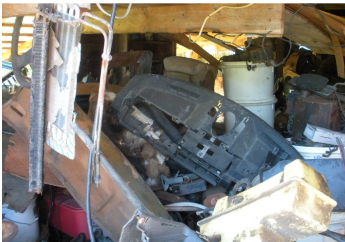
Then looking ahead with my senses saying don't go in any further, Danger! Danger!