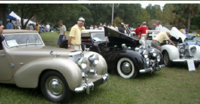
Help him find a Stag!