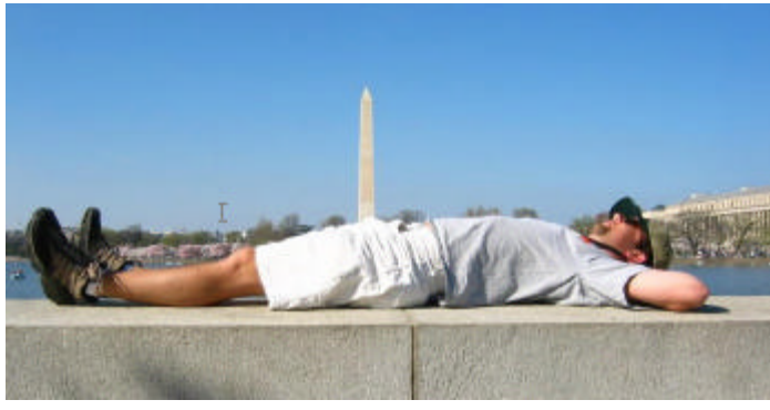
Dear Lord, I pray for Wisdom to understand my man; Love to forgive him; And Patience for his moods; Because Lord, if I pray for Strength, I'll beat him to death. Amen!