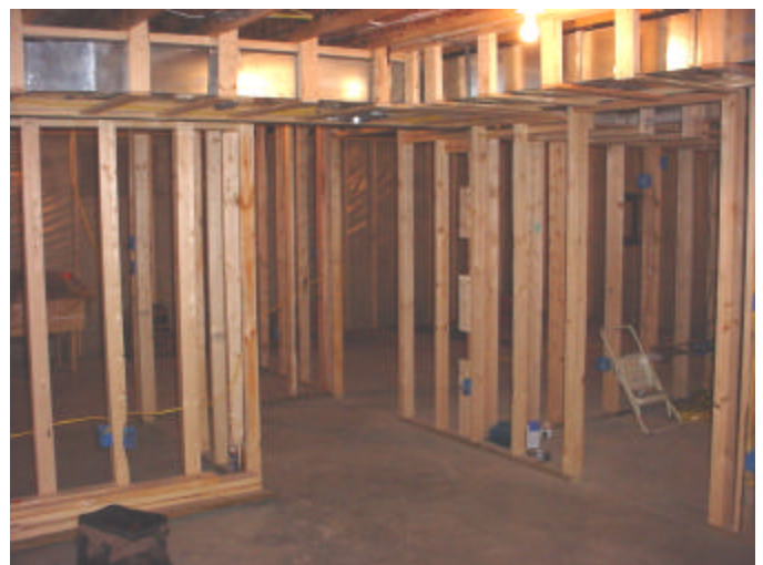
Forest of 2x4's – Music Room, etc.

We decided to completely finish our basement, doubling the room in the house. Although we're not doing most of the work ourselves, I have been doing the sound/phone/CATV wiring – about 2200 ft of wiring total, and this impacts garage wiring, so I've had to work that too. This means no work on the TRs. Oh, where did the stuff in the basement go? Into the garage, taking up one of the places for cars and making the garage a cramped mess. This means no work on TRs. How much is this costing? Don't ask, but it really means no work on TRs! Oh well, at least the house smells like fresh-cut pine!