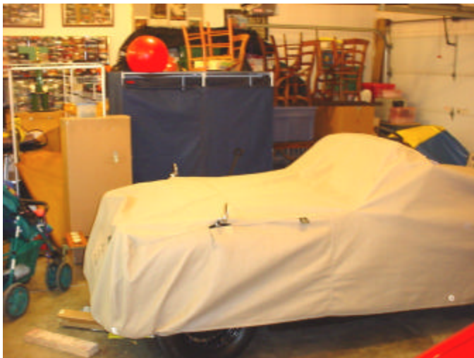
Garage Chock-Full of Stuff

Shhhh. The TR2's sleeping in the garage right in front of all the stuff we had to bring up from the basement as we get it finished. Hardly any room to really work on it, and since I want to rip the head off and redo the valves that will have to wait for the basement to be completed.