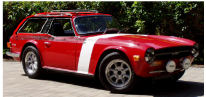
Big Chief Uhlig