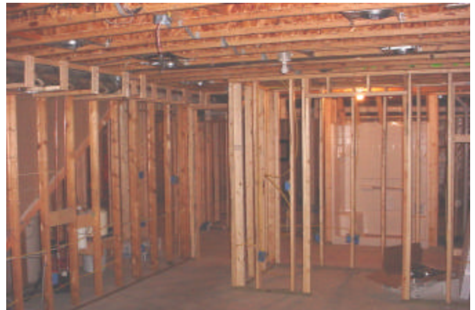
Forest Of 2x4's – Bedroom, Bathroom

Of course, the trick is when will I do this? And what is the reason for delay? Oh, just the small ocean of 2x4's appearing in our basement