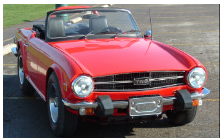
All cosmetics are new (interior, trunk, pimento red paint,

1975 TR6 I have decided to retire and move to PA to be near my son and his family, so I will be selling my 1975 TR6.