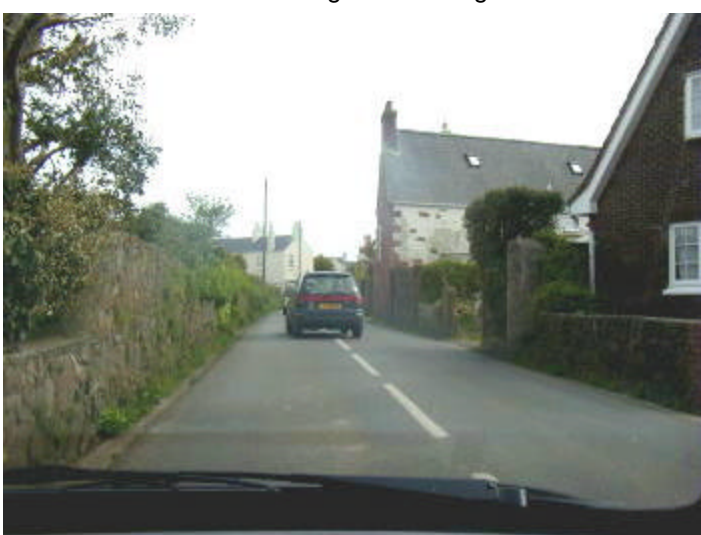
Countryside road in Jersey

many countries where they drive on the left hand side. Never a problem since I always had a vehicle with the steering wheel on the right. All the roads on Jersey are very narrow. The cars are equipped with brake away mirrors, a feature that I used. Thankfully that second car I rented had right hand drive; it would have been very difficult to operate a left hand drive auto on the left hand side of the narrow roads. Renting the car was a very pleasant experience; the gal at the rental counter was quite attractive. She explained where to return the car, told me the car had about a half tank of petrol and that I should buy only enough fuel to get the car back. This was all in a heavy French accent that was quite sexy. It's a shame that I was old enough to be her grandfather.