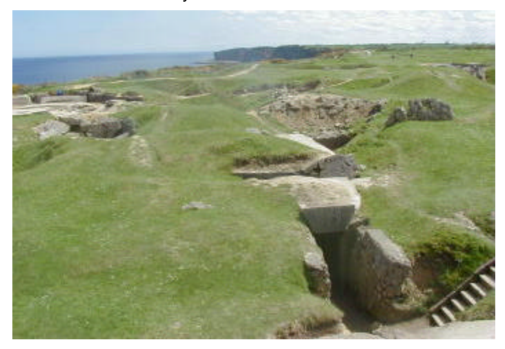
German Fortifications near Utah Beach

The final three days of the trip were spent on and around the Normandy invasion beaches. Most of the area near the American landing beaches is sparsely populated with small villages and farms and an occasional chateau. The area is well marked with the name of each beach (Omaha, Utah, Sword, Juno, etc). German fortifications are visible along all the beaches. Every village has one or several memorials and usually one or two museums.