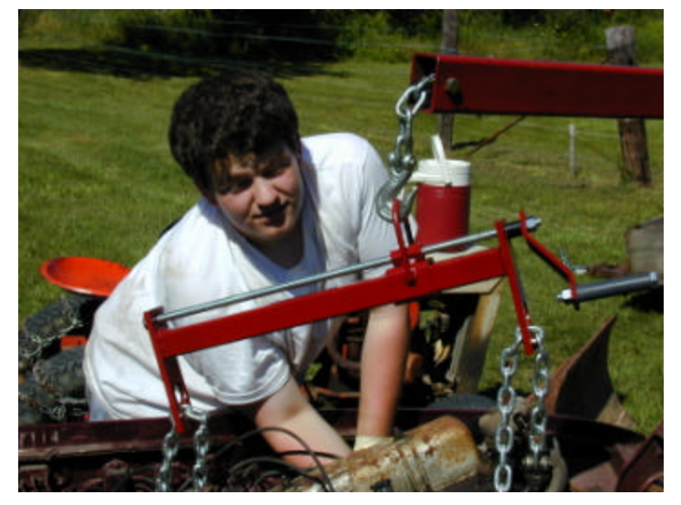
The TRIUMPH vs MG race at Mid Ohio was a bust. What happened to last years TR6 folks. Oh well – MG's kicked Triumph's ***.