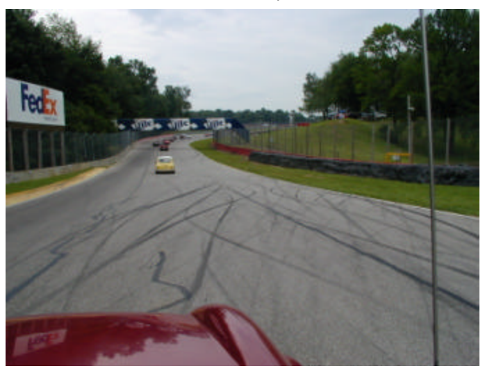
Here we are doing about 70 (oops - I mean 40) on the track . It was much more fun than last year.

The rest of the day wasn't much fun. The Buckeye Triumphs EZ up awning "got loose" in the wind and cart wheeled into (you guessed it) MY car. Big scratch in the front fender. Glad I was planning on a paint job this fall. If this had happened next year you wouldn't want to be near me.