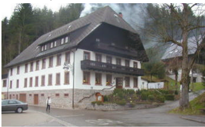
Black Forest Inn

Navigation on the expressways was pretty easy. One difference from the US is that the signs show the directions to specific cities, sometimes they show the route number and they never show the compass direction (north, south, etc.) I think this is done to accommodate those folks have no idea which direction they want to go. The signs listing towns became a problem when I got on the secondary roads. I had to lookup all the local village names so that I could follow the signs. Some signs pointed to towns with only a couple houses that weren't shown on my map. This added to the excitement and adventure. However, I did make it to Triberg with little trouble. Triberg is a lovely town of about 5,000 people. I had a nice room in a Gasthof in a nearby village --- cost about $40 per night including breakfast. The main attraction of the area is the picturesque hilly countryside and small villages.