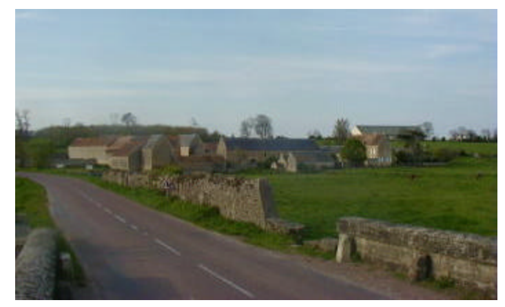
Countryside in Normandy near Mount St. Michael

One interesting thing about the Abby is the tide. Sometimes the water edge is a mile or so beyond the Abbey at low tide and 10 feet or so deep at the Abbey at high tide. When the tide comes in the edge of the water can move a mile or so in a few minutes. Many people have drowned on that beach.