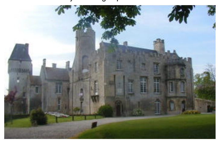
Chateau in small town in Normandy

were moved to the one remaining cemetery. In the German cemetery the markers have a black German cross. The inscriptions include the date of birth (not on the markers in the American cemetery) but don't include the military unit. There were a few graves with fresh flowers --- that is not permitted in the American cemetery. The British cemetery was somewhat different in that each marker contained the crest of the soldier's military unit and individual inscriptions provided by the family and there are flowers planted around each marker. There were also quite a few Germans soldiers, many unidentified, buried on the periphery of the British cemetery. Visiting the cemeteries is a very sobering experience.