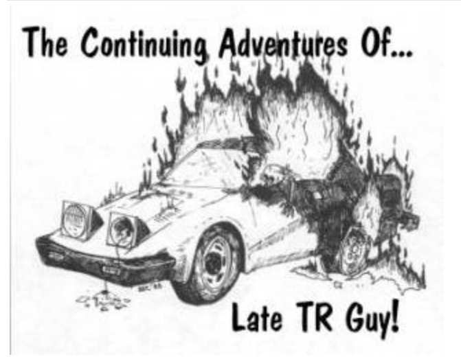
Jujy 2000: By Bruce Clough