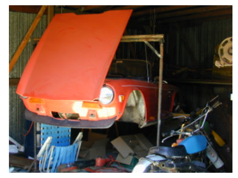
Some additional pictures include:

Work continues on our 74 rebuild. Here is what the body looks like now: