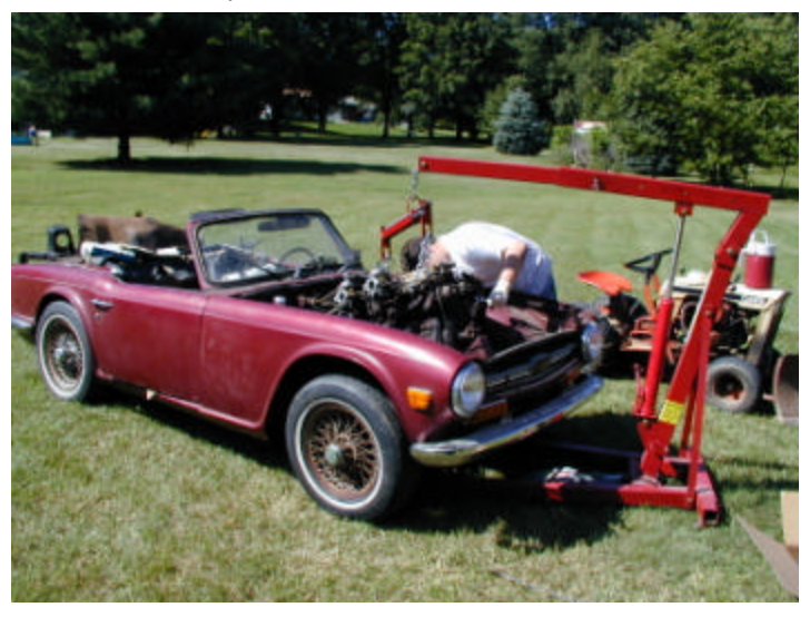
We now have a spare engine with good oil pressure! Our thanks again for the use of Nelson's engine hoist.