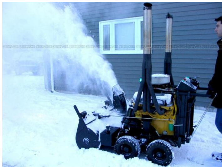
For the man with everything - the V8 snowblower

If you live (or ever have lived) 'Up North', ya gotta love this! Yep, it is for real!