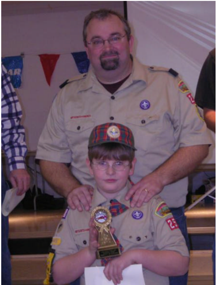
I managed to get mine on the race track.