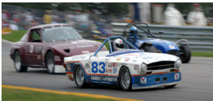
Is this a cool shot or what!