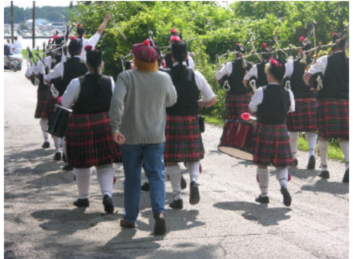
This is a nice event and Buckeye Triumphs should consider making the trip to the island.