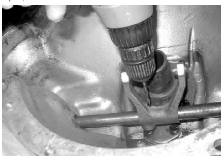
Drilling hole in clutch fork

It is very easy to remove the tapered part of the pin that is stuck in the operating shaft. First, one drills a 1/8 to 3/16 inch hole in the clutch fork directly across from the hole where the pin is inserted. Next, the fork is aligned on the shaft in the same position as if an unbroken pin were in place. Finally, the broken part of the pin is driven out with a pin punch inserted in the drilled hole.