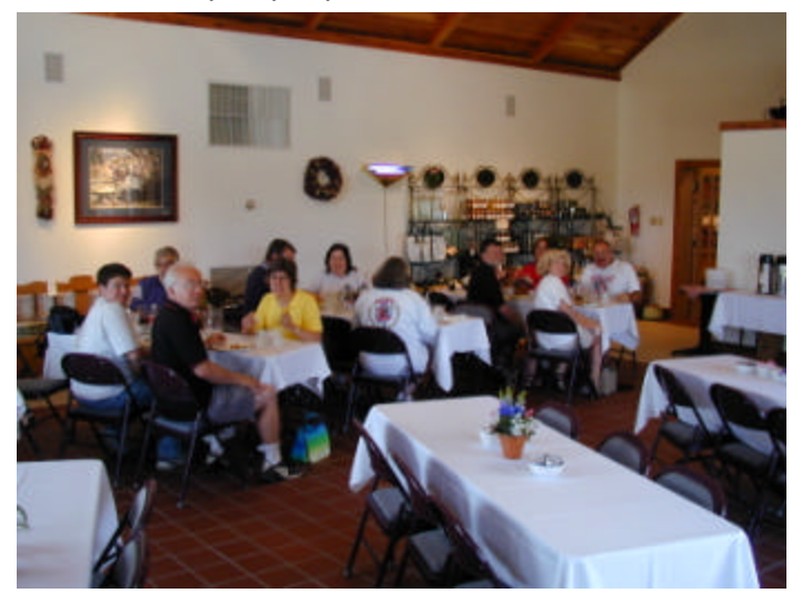
Sorry again for the late newsletter this month – hope we see you at The Roadster Factory summer party!