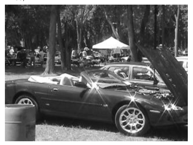
View Of The Early TRs From MVT HQ

Next time I'd like to suggest that we just decide to go park our cars and take our chairs over to the Spitfire section since they have the best shade. We'll designate this area as the "MVT HQ. Sure this is far from the TR4s and TR3s,