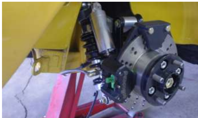
They Yellow round-tail Spitfire is for an owner out of Seattle. Chris was making it as 'street-legal' racer. Modifications included removing the seams, 'chopping' the wind screen to give it a boat look (the owner works for the Seattle Port Authority), and a rear diffuser on the tail.