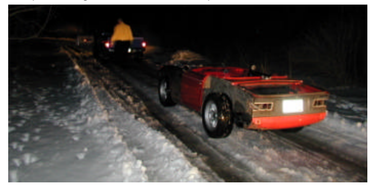
10 Inches of snow still on the ground.

is done. We had to move it from the barn to the garage to swap the engine, here are a few pics: